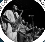
SUMMER CONCERTS AT PARKWOOD PARK