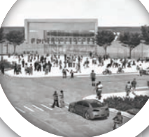
HEALTHY CAMPUS PLAN