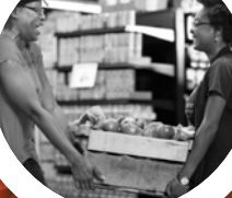
CO-OP GROCERY STORE