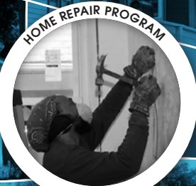
HOME REPAIR PROGRAM