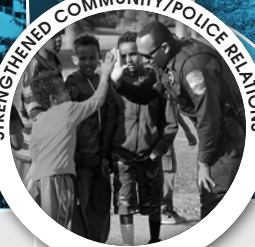
STRENGTHENED COMMUNITY/POLICE RELATIONS