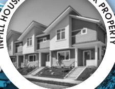
INFILL HOUSING ON LAND BANK PROPERTY