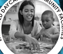
EXPANDED DAYCARE AT COMMUNITY FACILITIES