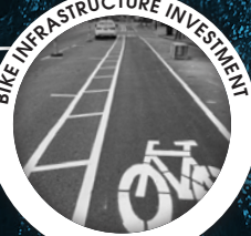
BIKE INFRASTRUCTURE INVESTMENT