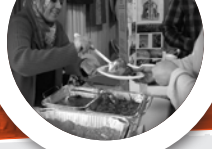
INTERNATIONAL FOOD FAIR