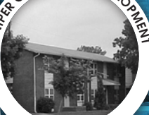
JUNIPER GARDENS REDEVELOPMENT