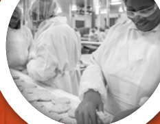
FOOD INDUSTRY TRAINING