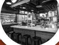
FAIRFAX FOOD HALL